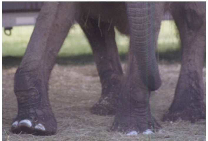
This wild-caught African elephant was hauled around the country for years by a traveling zoo that performed at fairs and festivals, despite suffering from angular limb deformities in three legs, degenerative joint disease and periodic lameness. She was eventually euthanized when she was only 19 years old, far short of an elephant's average lifespan.

Licensees are typically inspected once a year, although they may be inspected more frequently if there are chronic problems or complaints. Catching the most egregious abuse is rare since behind-the-scenes training sessions are completely unmonitored by authorities.