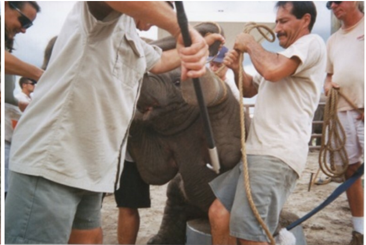
Trainers condition elephants to fear the bullhook at a very young age.

A bullhook resembles a fireplace poker and consists of a long rod, sharp metal hook and spiked tip, and is used as a weapon to inflict pain and suffering on elephants. Trainers use the hooked and pointed end to strike, jab, pull, prod and hook sensitive spots on the elephant's body, such as behind their ears, and on their feet and trunks. The use of bullhooks results in trauma and physical injury, often including lacerations, puncture wounds and abscesses. This barbaric device is used by all circuses that use elephants.