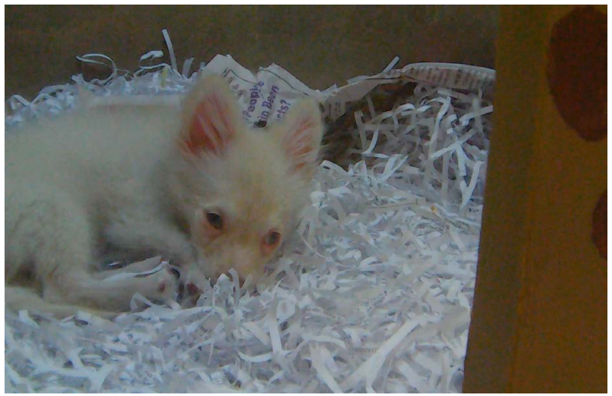
Pets & Pals refused to give breeder information on this ill-looking puppy.