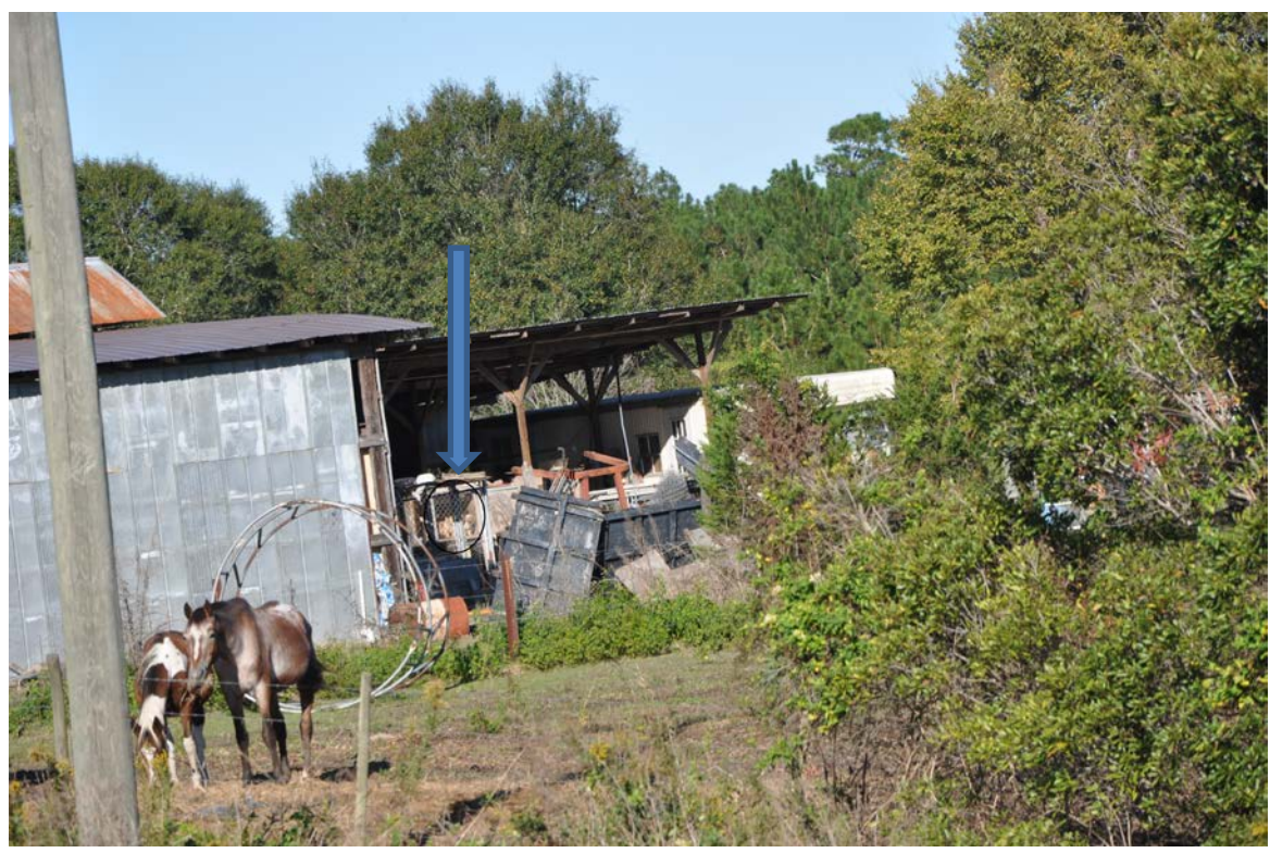
James Cliett of Jacksonville, GA - puppies standing in cage