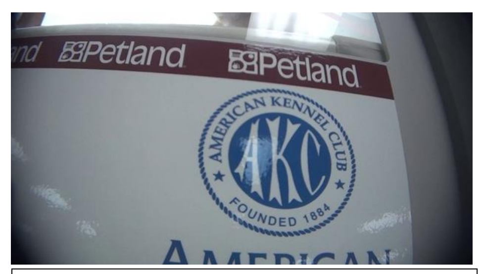
Above: An "AKC inspected" sign in the Sarasota Petland store gives buyers a false impression that the American Kennel Club oversees the health and quality of Petland's puppies. The AKC is not an animal welfare group and has no law enforcement powers.

As we revealed in the May 2019 Horrible Hundred report, Tiffanie's LLC, a USDA<sup>6</sup>-licensed broker (distributor), was the subject of a state investigation in June and July 2018 which revealed that 35 puppies had died