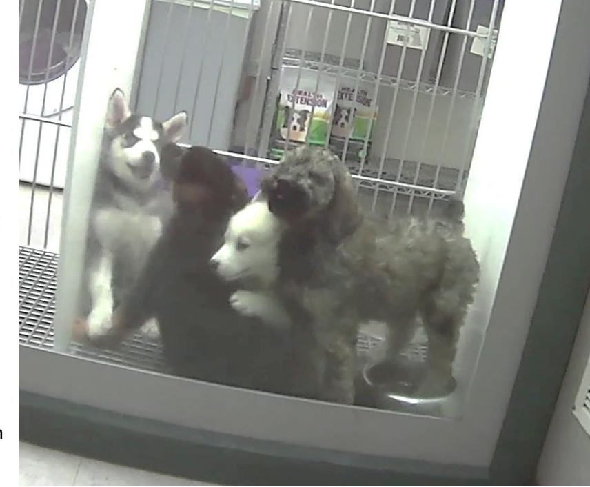
Overcrowding in the Sarasota, Florida, Petland store.