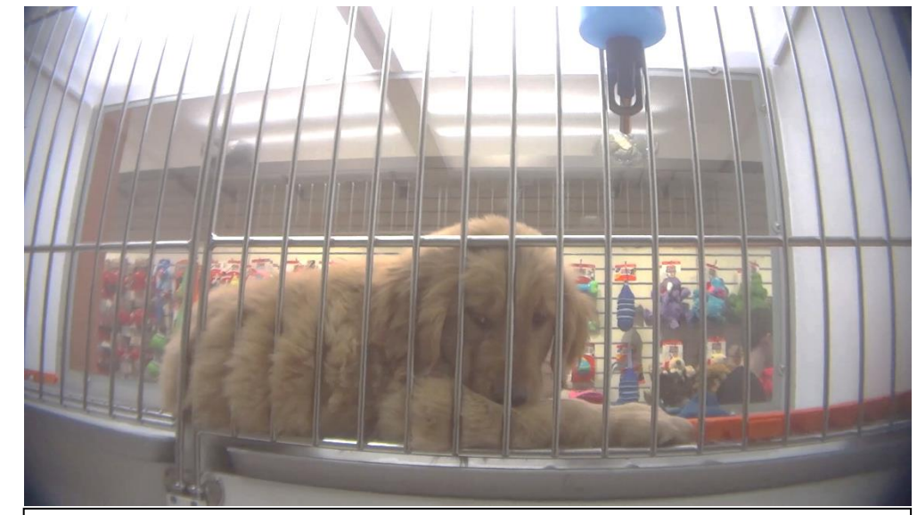
A sick golden retriever in the Michigan Petland store was lethargic and had a runny nose, yet was still up for sale. Our investigator regularly overheard Petland employees talking to buyers who called to complain about sick puppies.

In the back room, puppies were often treated for issues such as persistent diarrhea, nasal discharge and other respiratory problems. Several sick animals were given medications at the discretion of